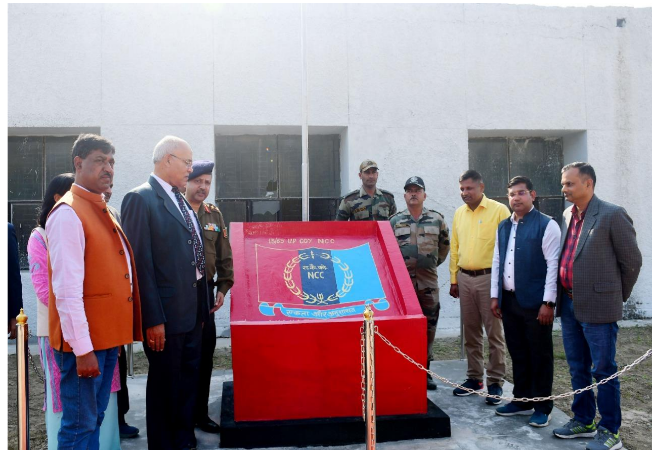
NCC Unit From Battalion 13/65 UP COY inaugurated by Hon'ble Vice Chancellor at main campus ANDUA&T, Kumarganj, Ayodhya, 22.11.2022