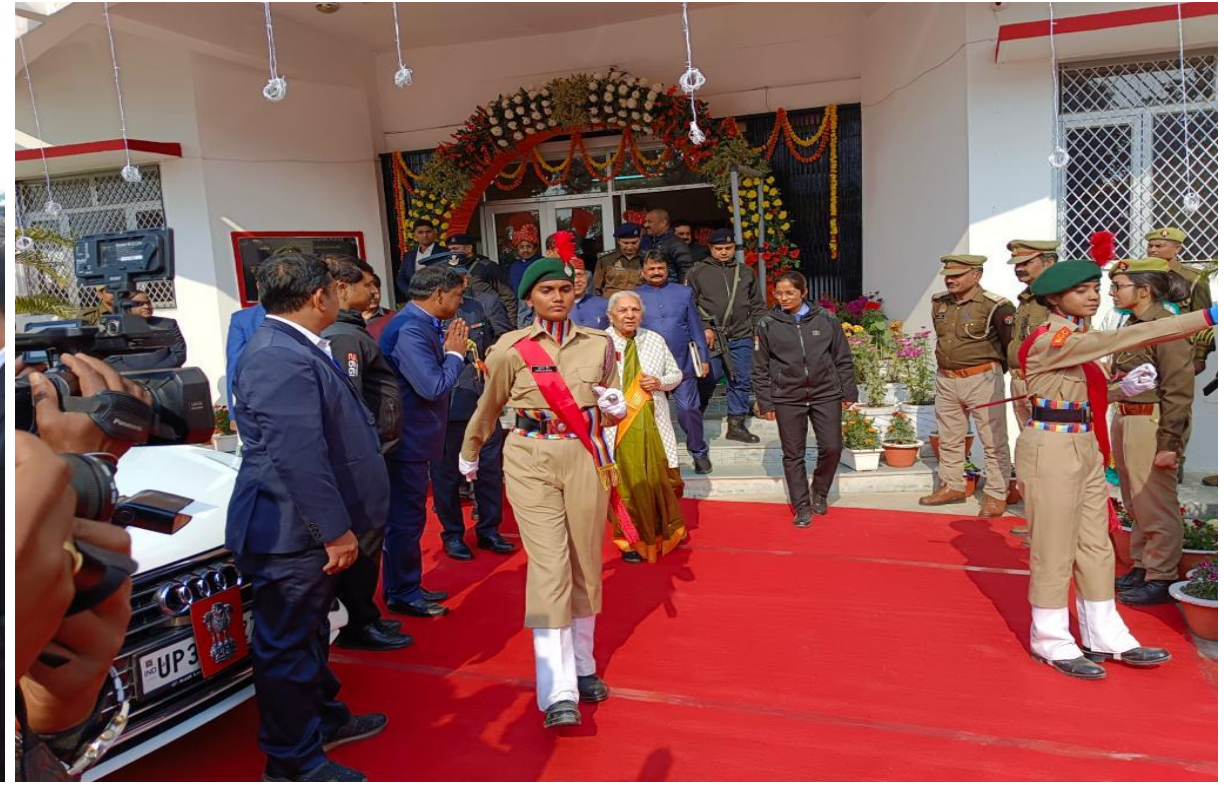
Piloting of Hon'ble Governor during 24 th Convocation of the university