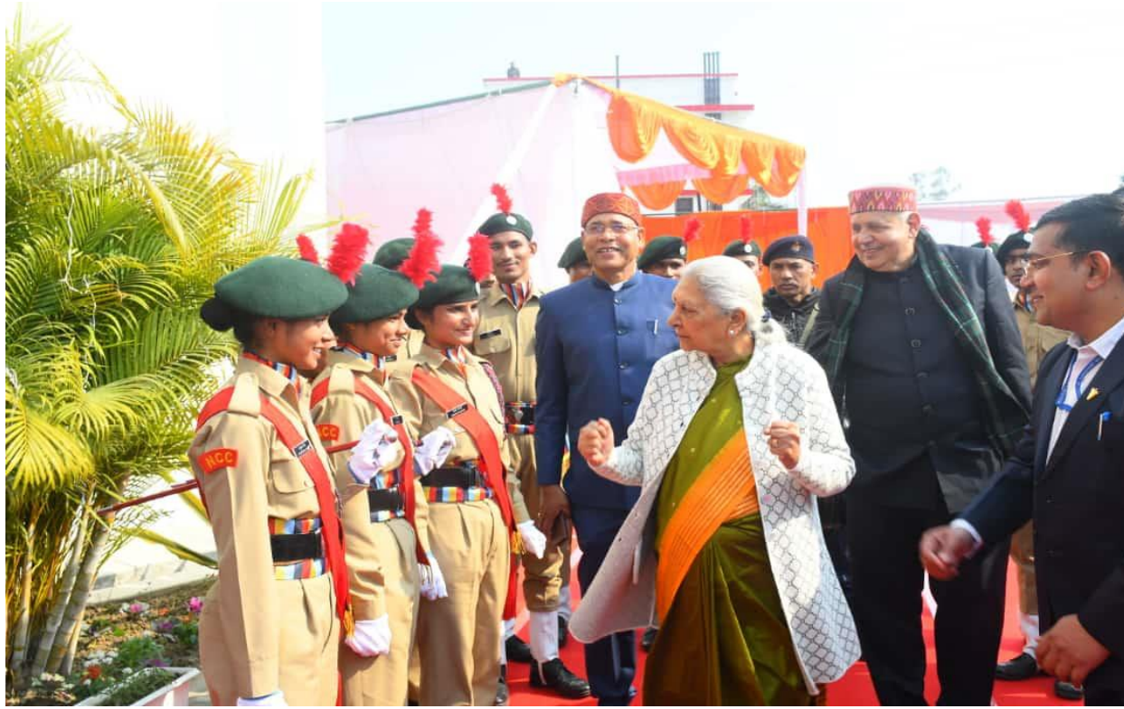
Encouraging to NCC cadets of the university by Hon'ble Governor