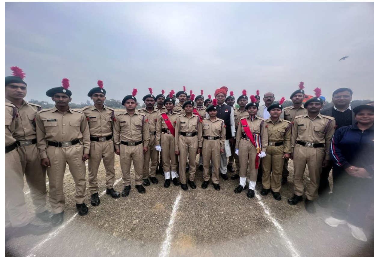
NCC cadets encouraged by Hon'ble Vice Chancellor at Republic Day at the main campus of the university